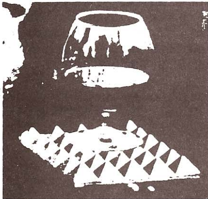
WINE ATOP "ENERGY GENERATOR"

to reach the mystical pitch that Wilhelm Reich created for his orgone box 30 years ago, but a semiserious microcult is gathering around the geometric form in which ancient Egyptians buried their pharaohs. Some experts have theorized that pyramids focused energy in a manner that made a better mummy.